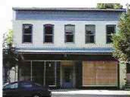
13-15 East Main Street