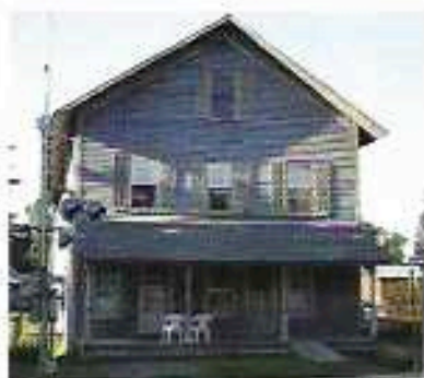
One East Main Street